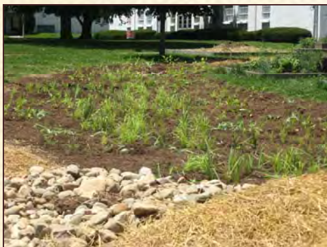
Rain Garden installed at the Marion County 4-H Fairgrounds