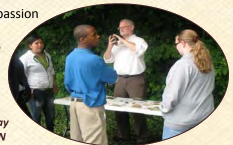
2010 Youth Conservation Day at Symbiosis in Shelbyville, IN

I would like to thank all those who had been involved with this committee for their passion and dedication to environmental education. It's because of you that our workshops and activities were so successful over the years! Although the education committee is not currently active, we still support other educational events throughout the area—just contact the office.