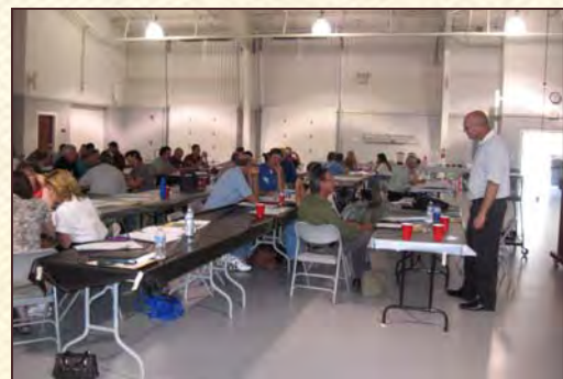
Green Site Planning Workshop

A big thanks to the committee members, volunteers and RC&D staff for making these successful projects come to life. If you would like to help with a project or have an idea, please contact the office.