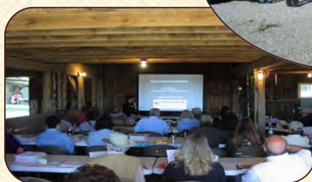
NRE Workshop at Dull's Tree Farm