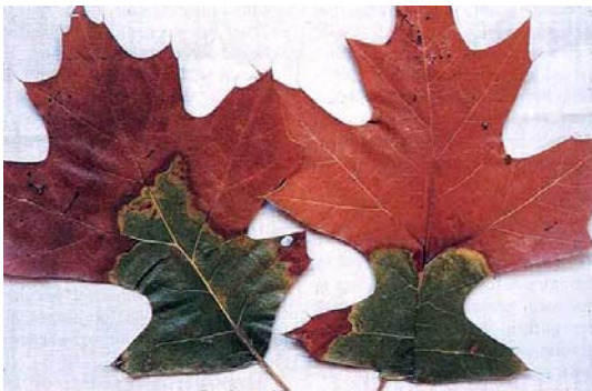
Oak wilt