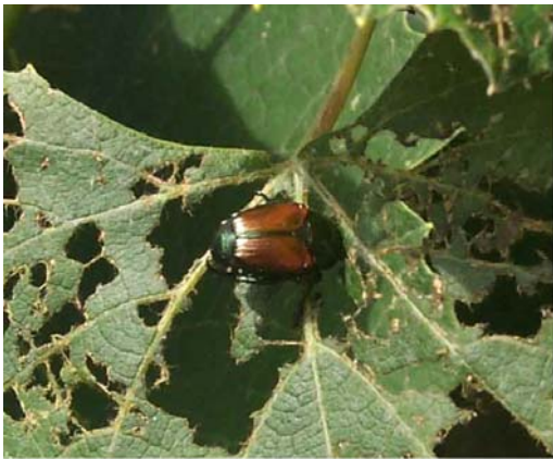
Japanese beetle

Pest management is the identification and control of backyard nuisances—including diseases, insects, weeds, and problematic wildlife. By spotting these issues early and treating them directly and properly, you can drastically improve the health of your backyard.