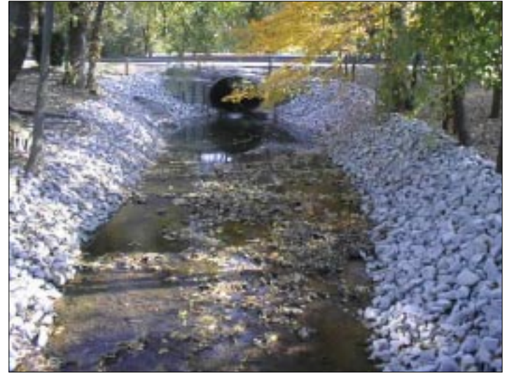
After stabilization, the stream bank is armored against further undercutting with rip rap.