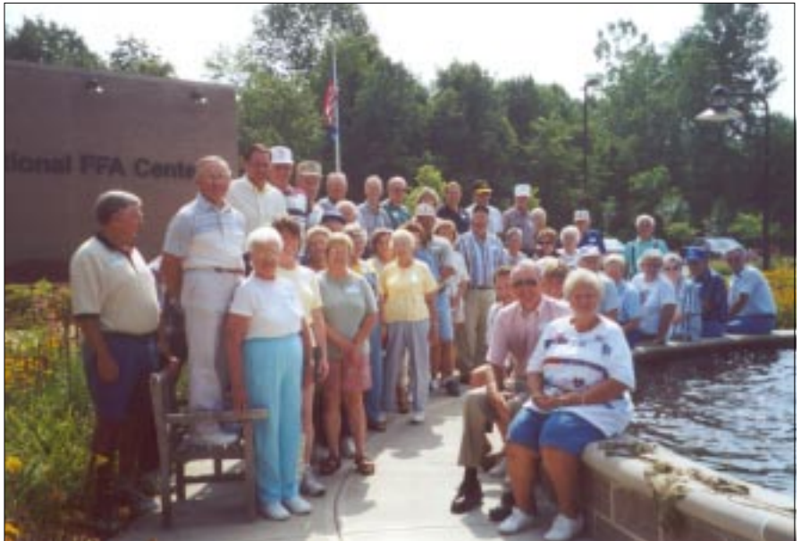
Over 60 Wayne County farmers attended an urban tour hosted by the Hoosier Heartland RC&D Council and Marion County Soil and Water Conservation District.