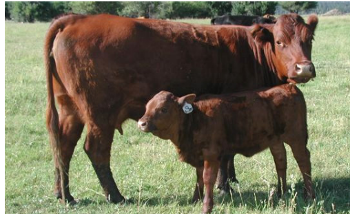
American Herbataurus Cow/calf

Do you have the right equipment to harvest your grass? Your cows should produce a calf every year, nurse it for ten months, and maintain body condition all year on grass, hay and minerals. Do you know what that cow looks like and where to find them? The American Herbataurus Society is here to help. Our vision is to help both the commercial and direct marketing beef producer establish genetic quality and stability, and grass-based functionality in his/her herd.